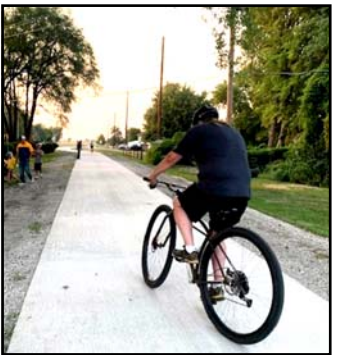
we have better Above : Bike riders enjoy the aligned the grant fo- new Red Rock Prairie Trail. cus and awards to