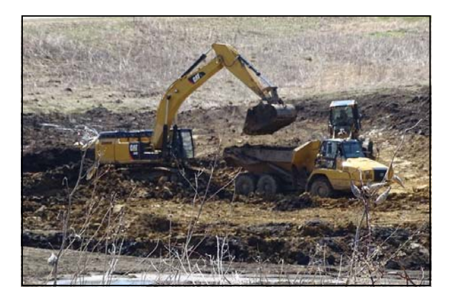
Above: There will be over 19,000 of these dump truck loads of sediment hauled out of Mariposa Lake.

Visualizing this amount of earthwork can be difficult, but equating this number to over 19,000 single axle dump truck loads is amazing! Stop by this fall and watch the progress, as they install new concrete principal spillways, a fishing jetty, wetland, boat ramp and fish habitat!